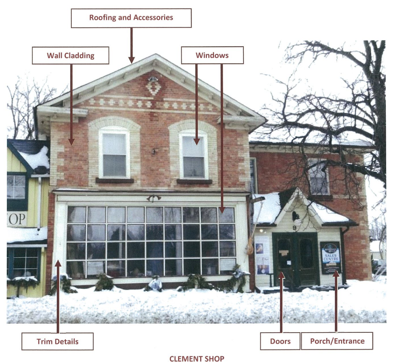
9 Queen Street- Heritage Value: Medium

Please complete the following table to provide input on the commercial architectural elements shown on the Clement Shop below: